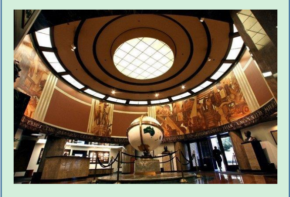
September 17 Luncheon Meeting The speaker to be announced – The meeting to be held at the California Club

September 11 Venue Series Los Angeles Times Editorial Offices Tour – The historic 1935 Moderne style building with its historical exhibits, editorial offices, and Hugo Ballin murals.